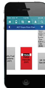
Exhibit Hall Map Booth Background

Sponsor's booth space background is colored on the interactive exhibit floor map.